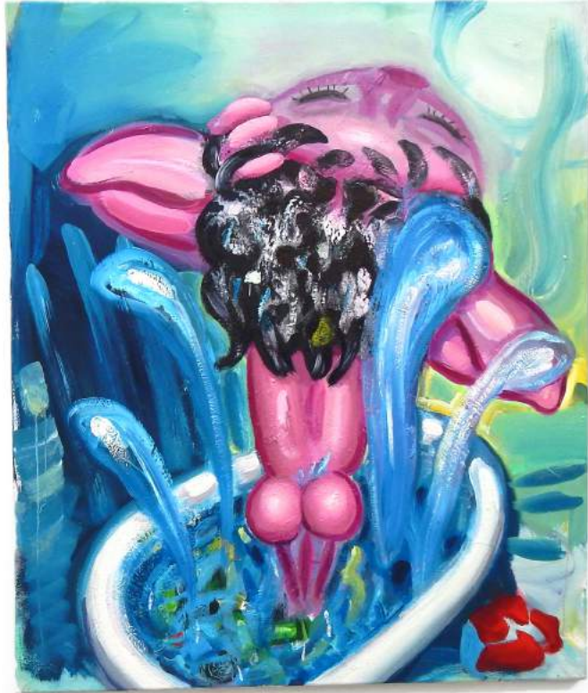
Left to right: Stop Clock , 2018, 40 x 30 cm, oil on canvas Solstice , 2018, 105 x 90 cm, oil on canvas