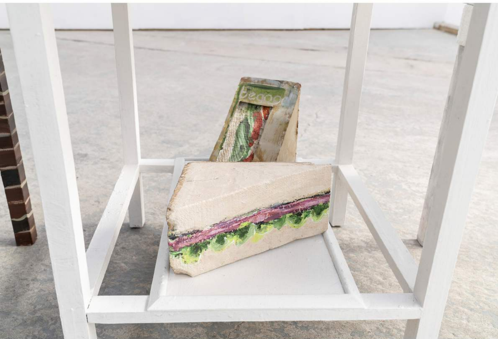
Morality Sandwiches , 2018, oil on wood, tin, enamel, solder dimensions variable