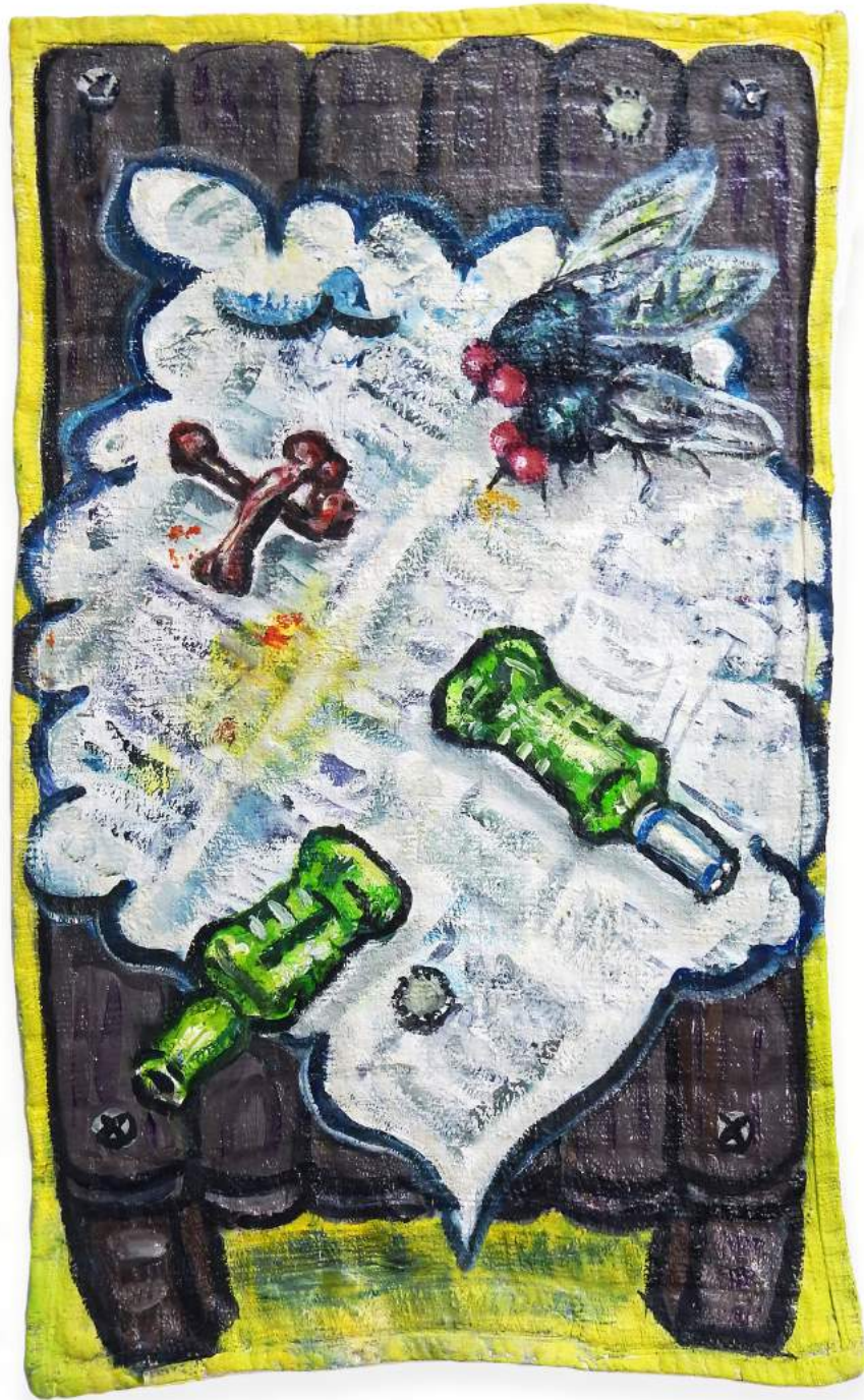
Good Swig , 2018, 64 x 38cm, oil on cotton