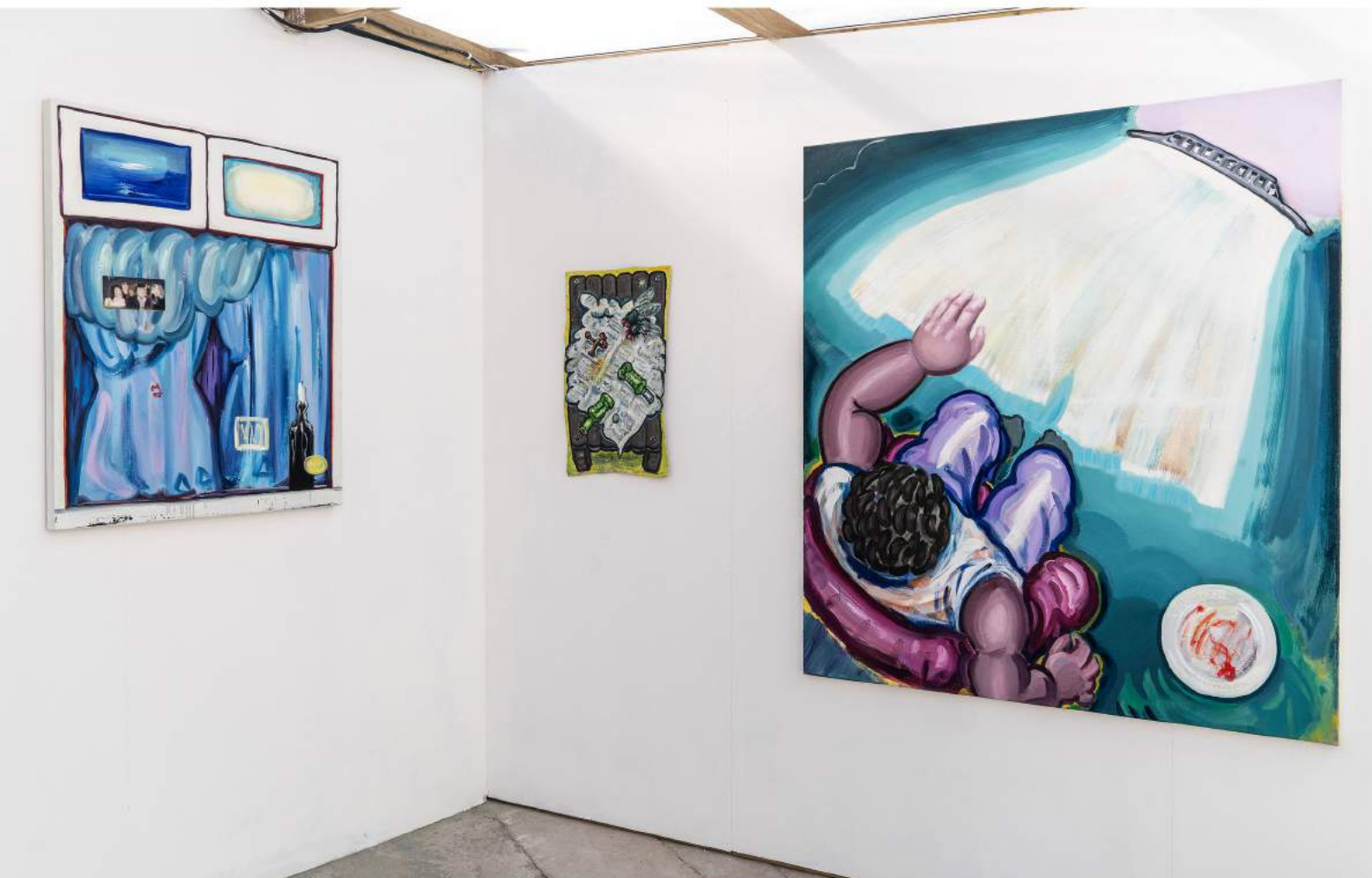
Left to right: Double Glaze , 2018, 100 x 80 cm, oil on canvas Good Swig , 2018, 64 x 38cm, oil on cotton Fifth Channel , 2018, 145 x 130 cm, oil on canvas